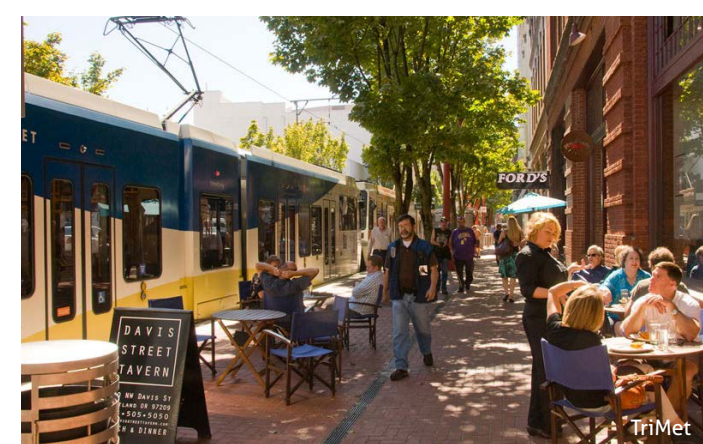
TriMet Portland Transit Mall