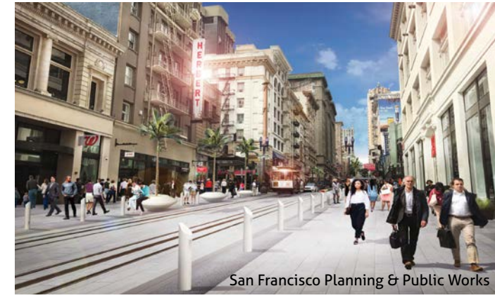
San Francisco Planning & Public Works Powell Streetscape Project rendering, San Francisco