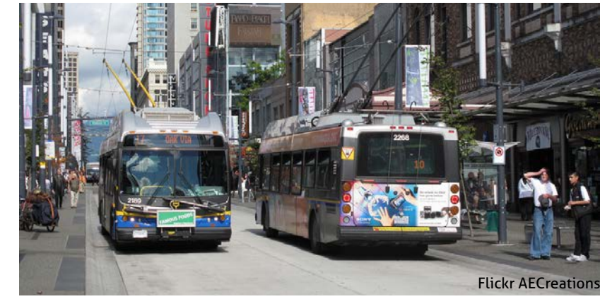
Flickr AECreations Granville Transit Mall, Vancouver, BC