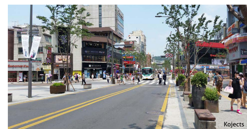
Kojects Seoul Transit Mall